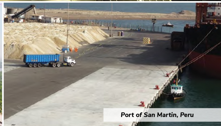
Port of San Martin, Peru