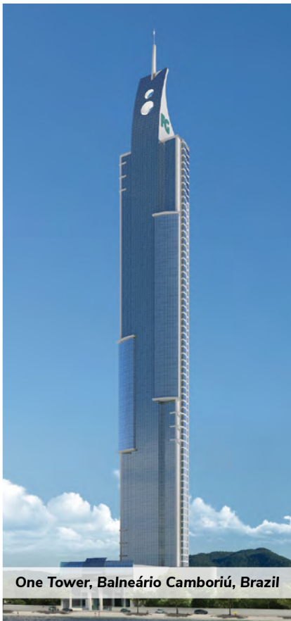
One Tower, Balneário Camboriú, Brazil