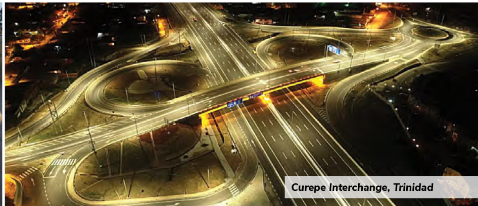
Curepe Interchange, Trinidad