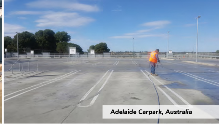
Adelaide Carpark, Australia