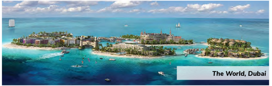
The World, Dubai

Below are just a few of the major projects CWS has completed in Asia-Pacific, Europe, the Middle East and the Americas.