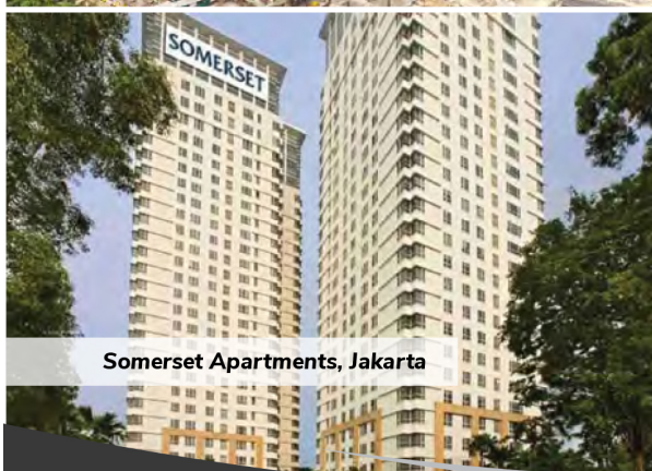
Somerset Apartments, Jakarta