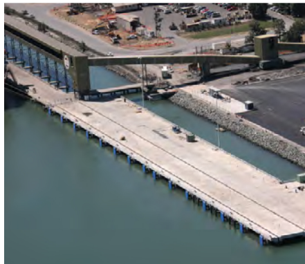
▲ Wharf & marine structures

Because of its ability to withstand thermal stress and its super-fast application, CWS100® is particularly suitable for areas of exposed concrete such as above-ground applications and water tanks.