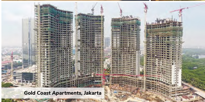
Gold Coast Apartments, Jakarta