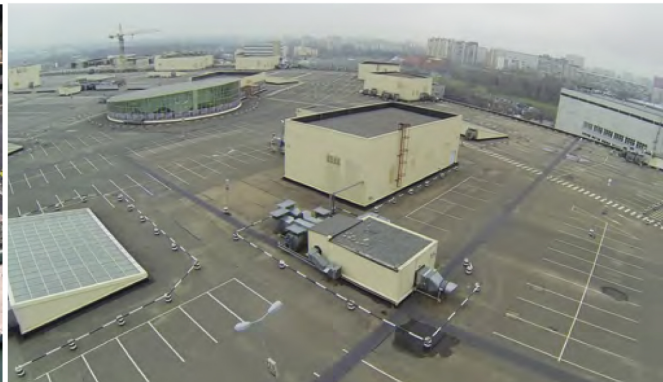
▲ Shopping centre rooftops