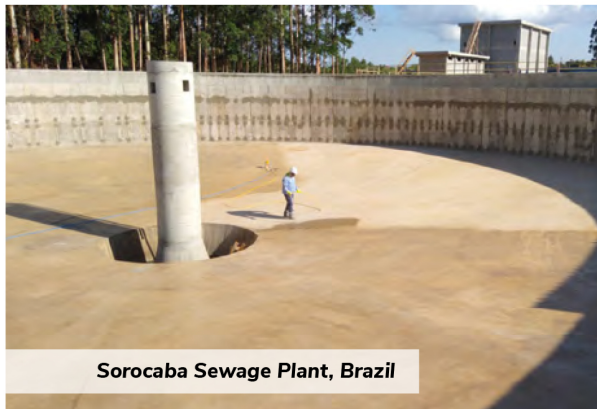
Sorocaba Sewage Plant, Brazil