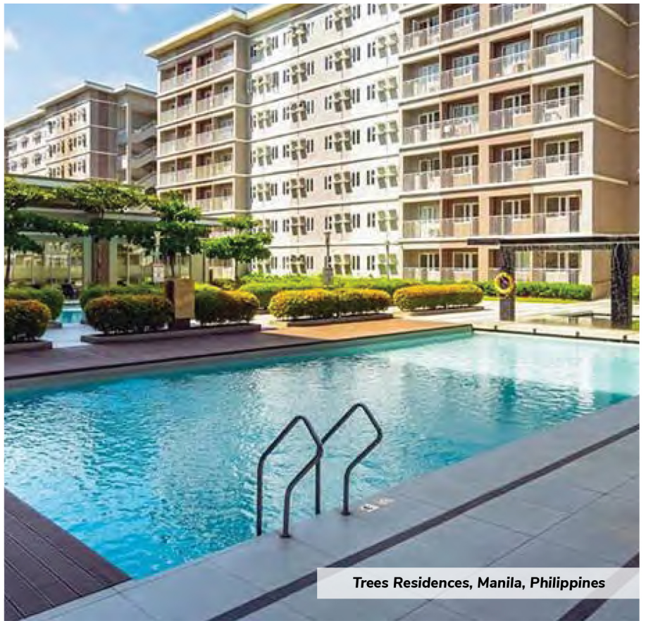
Trees Residences, Manila, Philippines