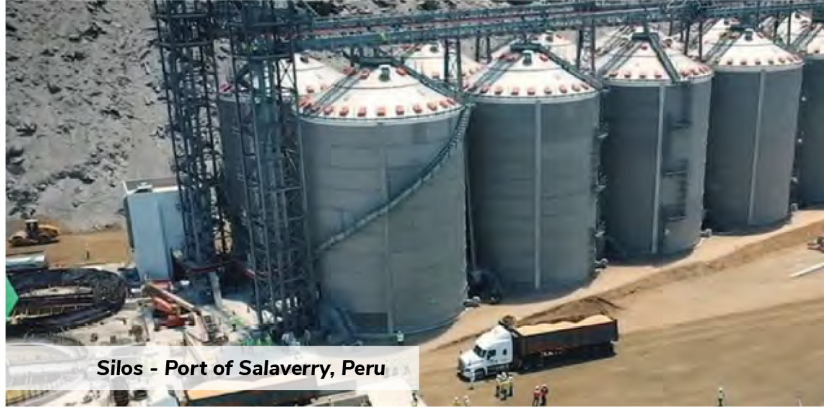
Silos - Port of Salaverry, Peru