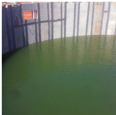
▲ Water tanks