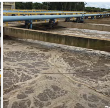
▲ Wastewater plants