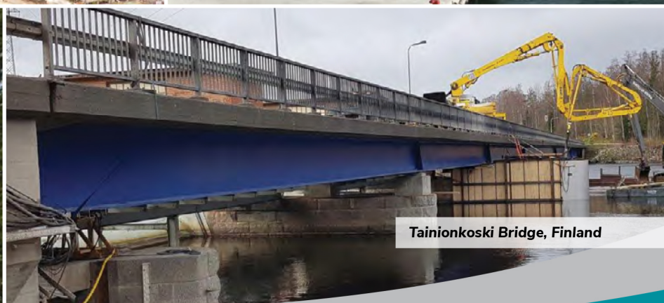
Tainionkoski Bridge, Finland